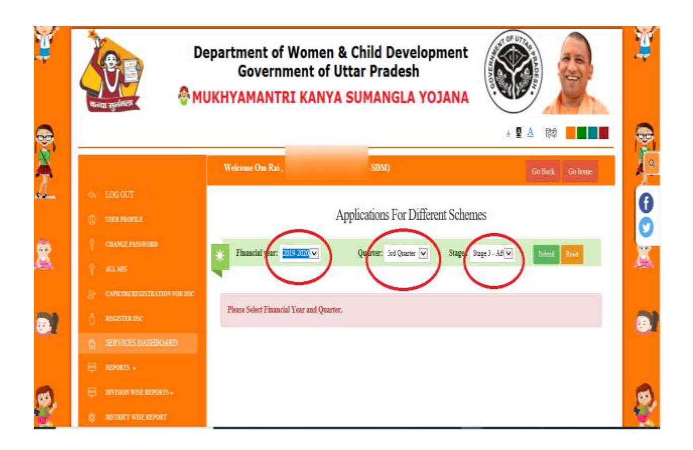
Step- 1: Go With Service Dashboard (SDM/BDO) and Select financial year, quarter and stage (3, 4, 5, 6)

We are reduced steps for these applications (single to bulk with DSC). Steps are following